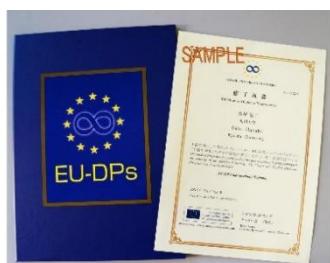
EU Studies Diploma Certification

Please check "Voices from Students" on our website.